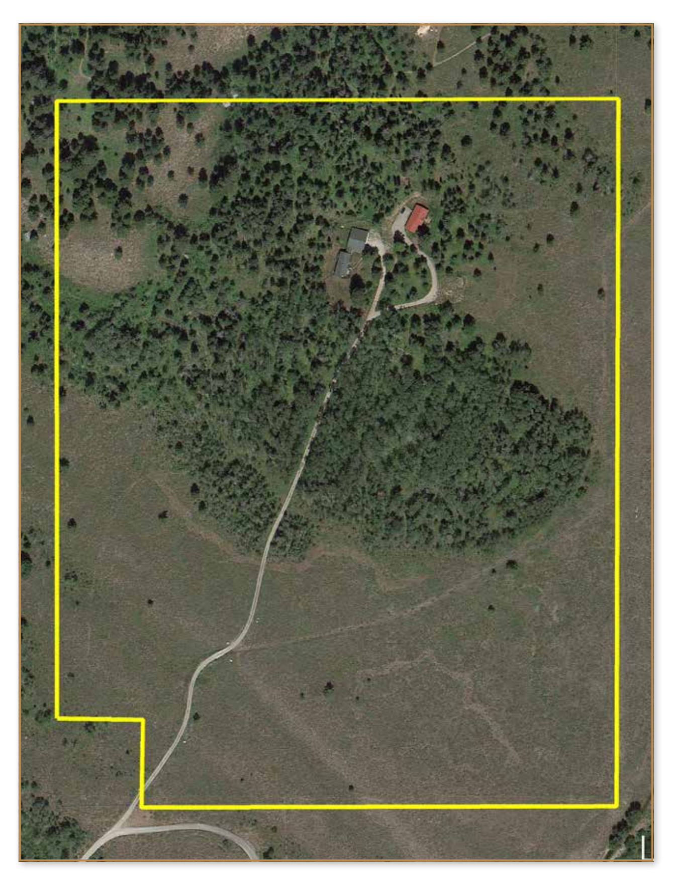
Fish Creek Road Estate Aerial Map Maps are for visual aid only ~ accuracy is not guaranteed.